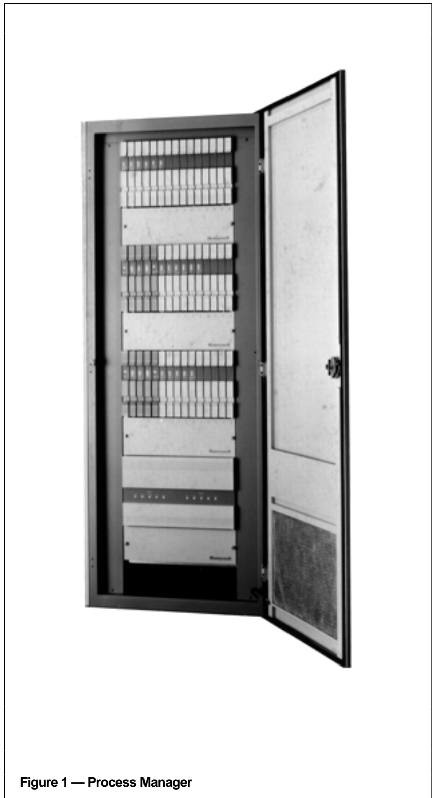
Figure 1 — Process Manager